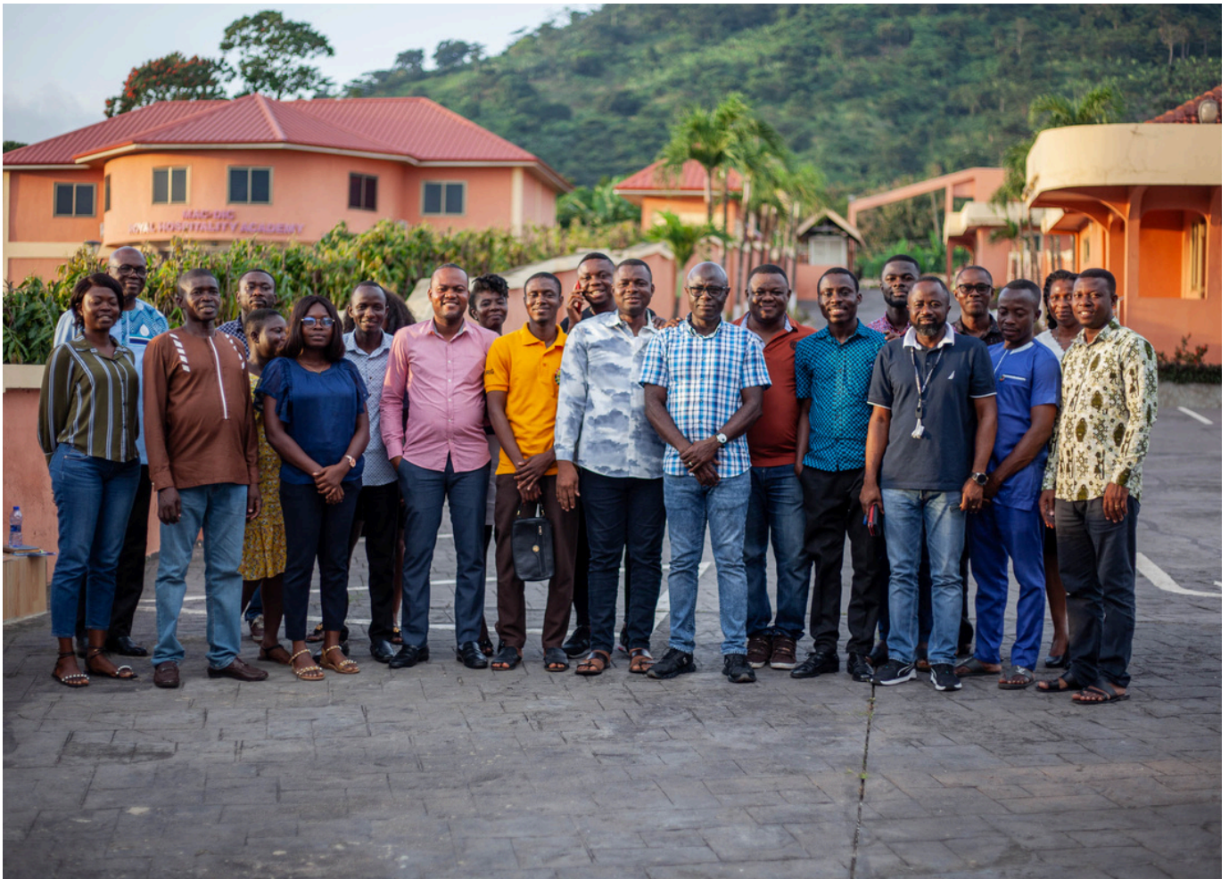
Group photograph of ACEPA team, Staff of GSS, and trainees

It explored how uncertainty changes what evidence is needed by users, how they use it, and how they navigate periods of instability. It also reflected on the role of evidence brokers in supporting evidence use at such times, and proffered advice and recommendations for think tanks/CSOs.