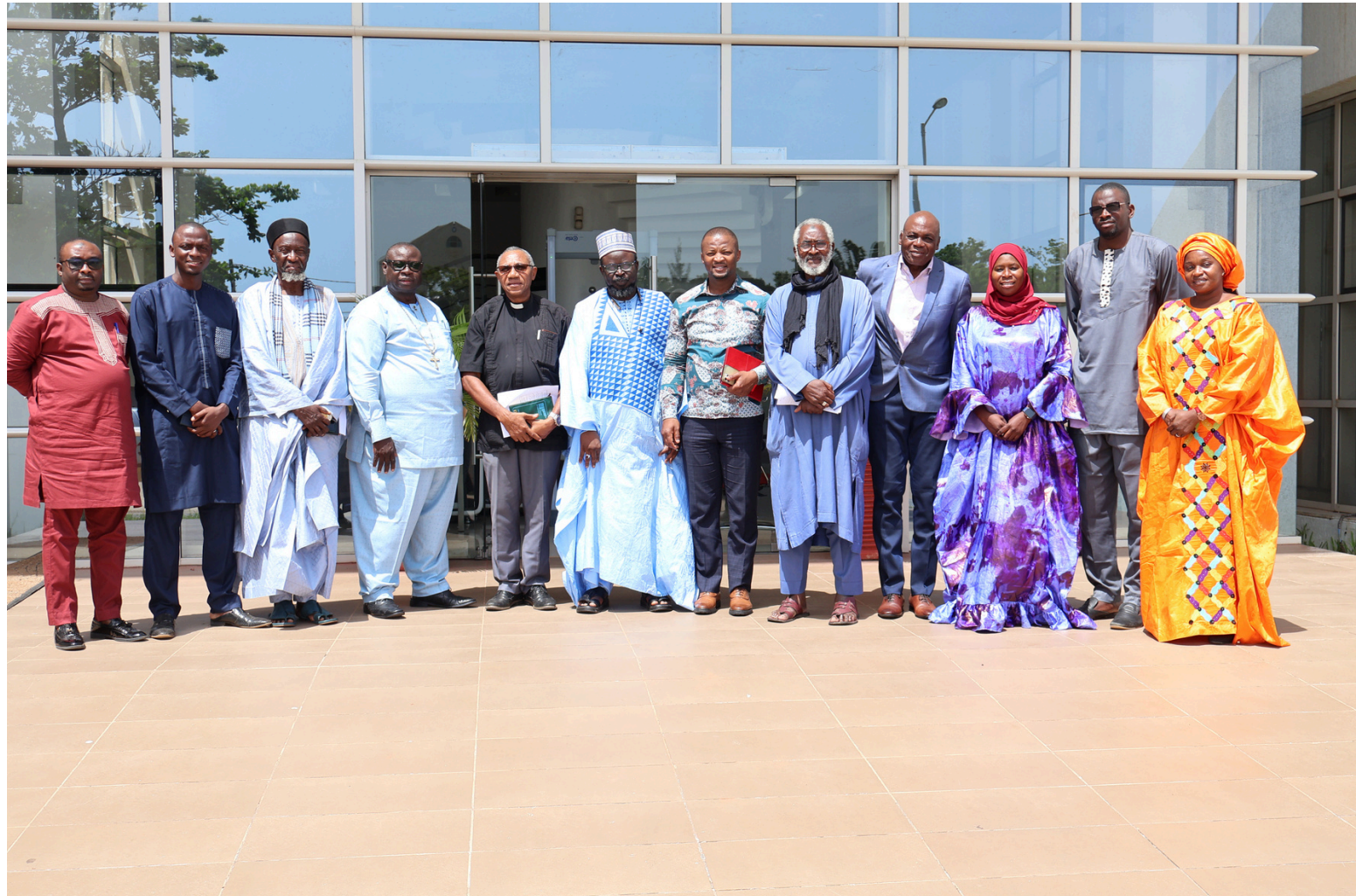
Group photograph of some stakeholders of FoRB at an event in The Gambia

The conference attracted religious freedom enthusiasts from across the globe who shared ideas and experiences on issues of FoRB.