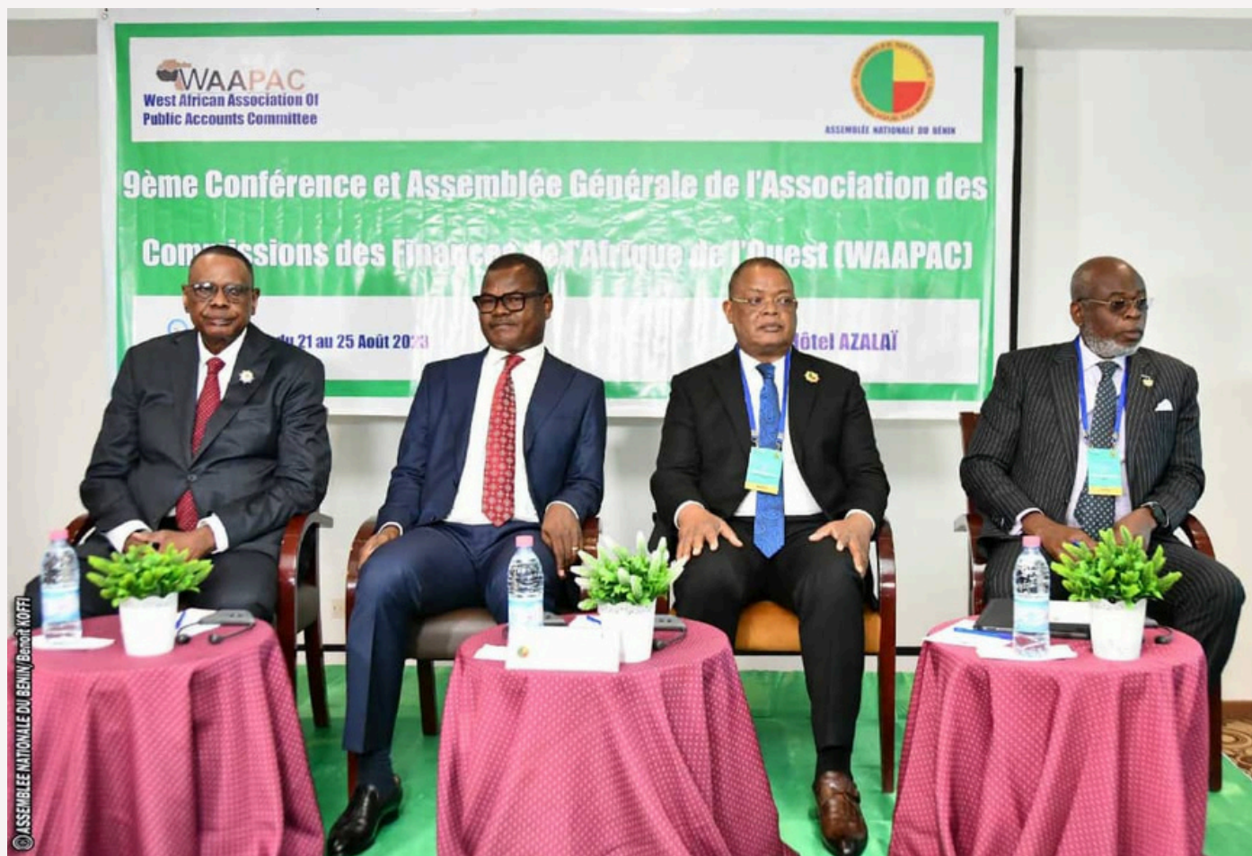
The 1st Deputy Speaker of the National Assembly of Benin (2nd from left) with WAAPAC Executive Committee Members at the opening of the 2023 annual conference

The training brought together 40 participants from six countries namely Benin, Burkina Faso, Chad, Côte d'Ivoire, Guinea, and Mali as well as representatives from AFROPAC Executive Committee members and SADCOPAC. The training explored themes such as effective oversight of public resources, strengthening relationships between Public Accounts Committees (PACs) and Supreme Audit Institutions (SAIs), and the role of Parliament in curbing illicit financial flows among others.