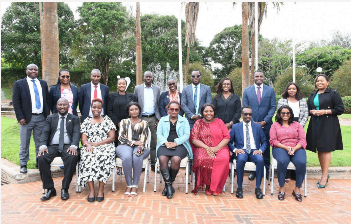
Group photograph of our Kenya team and participants

Another major focus of the IGLRP is supporting Parliamentary Administrations to become more gender-sensitive and responsive. The project in the previous year commissioned two assessments in all countries looking at 1) Administration and HR Management practices processes and policies and 2) Strategic Plans of Parliaments to determine their gender sensitivity. These assessments were concluded during the year under review and have led to the identification of gaps and areas that need to be improved and the adoption of gender-sensitive strategic priorities.